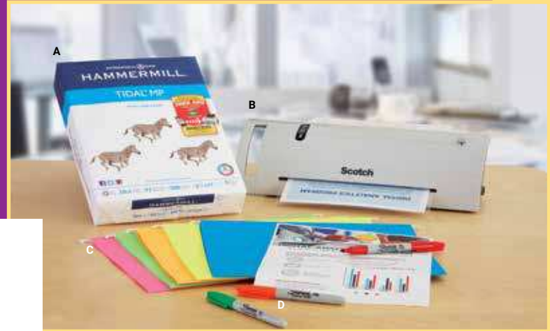
A. HAM-162008 B. MMM-TL902VP C. PFX-81672 D. SAN-30078

See our website for document management tools to boost organization, efficiency and productivity.