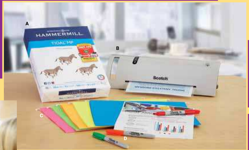
A. HAM-162008 B. MMM-TL902VP C. PFX-81672 D. SAN-30078