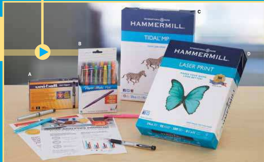
A. SAN-65800 B. PAP-70644 C. HAM-162008 D. HAM-104604

From letters, spreadsheets, meeting notes and more, ensure your documents are effective and impactful with the right products.